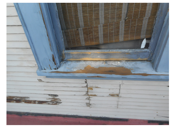
IMB "BEFORE" photos: replacing dry-rotted wood and sealing the exterior was first priority.

Still on the "to do" list for the IMB are exterior lighting, back patio replacement, dead tree replacement, interior wall water damage repair, interior painting, window treatments,