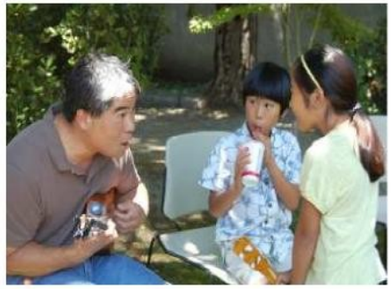
Children's Day Backyard Party