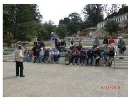
Angel Island Excursion