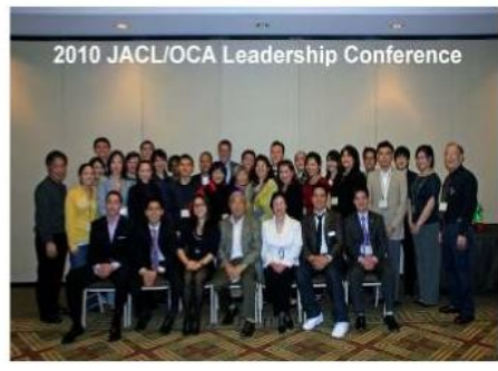
Washington D.C. Leadership Conference