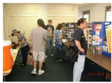
Issei Memorial Building Open House