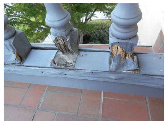
IMB “BEFORE” photos: replacing dry-rotted wood and sealing the exterior was first priority.