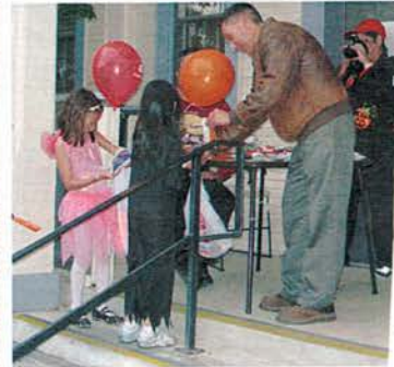
IMB Trick or Treaters