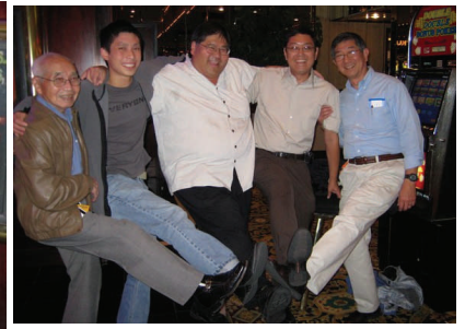
Don't know what this is.