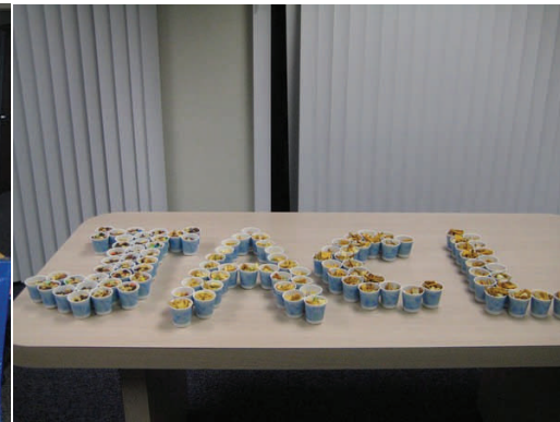
We provided the snacks