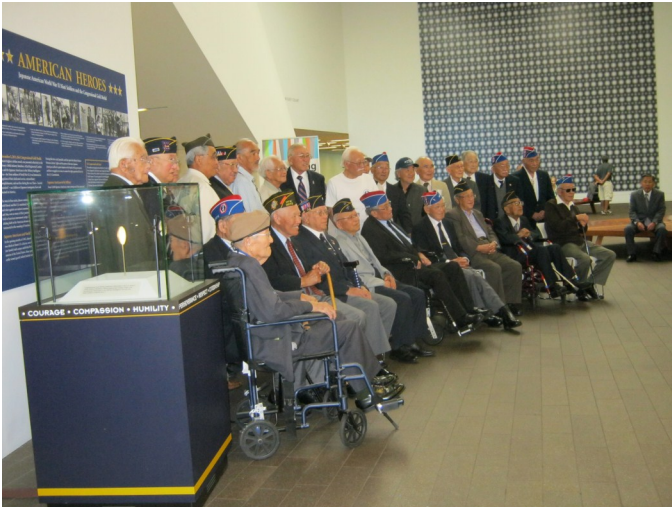
The veterans of the 100th/442nd & MIS next to the Congressional Gold Medal in the Wilsey Court, DeYoung Museum.

Here are a few notes and pictures from Saturday's Congressional Gold Medal event honoring the Nisei Soldiers of WWII