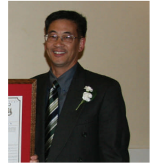
San Jose Taiko

This year we are proud to announce that ATT and Southwest Airlines are on board to be major community partners.