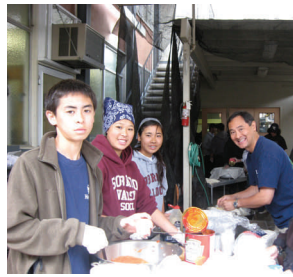
Hard working volunteers