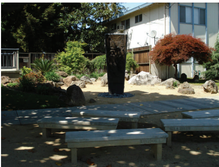
Ikoi no Ba, Issei Memorial Building