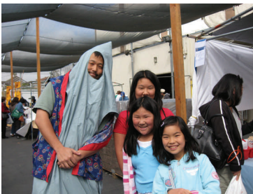
Ika Man & some adoring fans

This year we had an Ika shortage and did a combo meal of Ika and French fries. Since this was the first year we had trouble getting the portions right. Next year, we will be better prepared to do the combo meal.