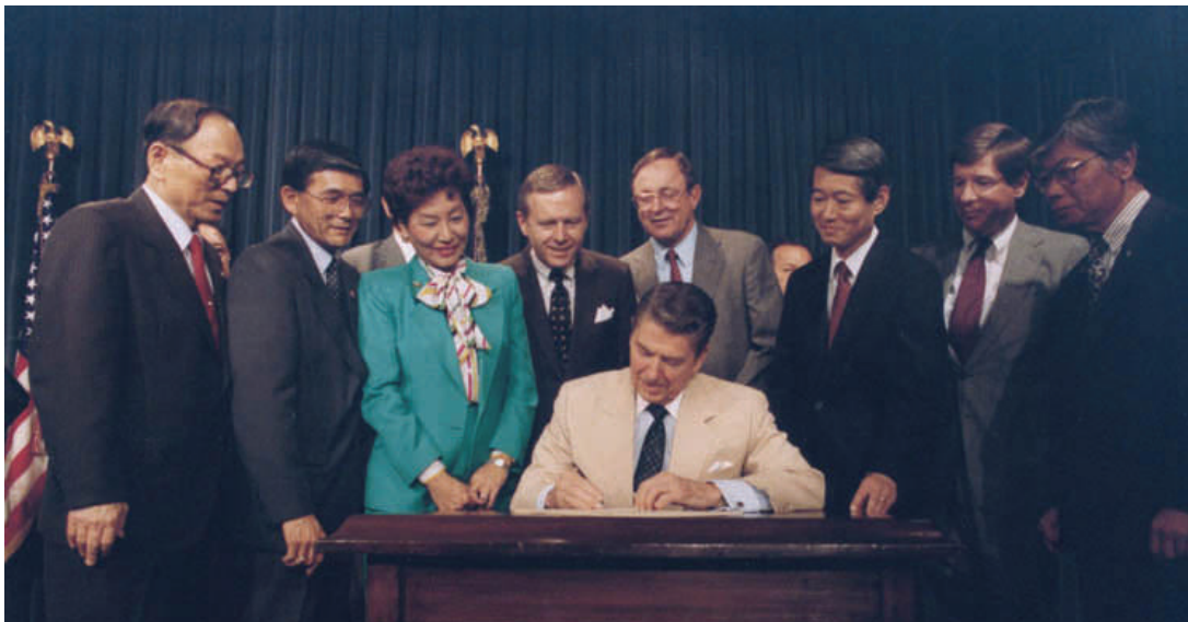
President Ronald Reagan signs the Civil Liberties Act of 1988 with then Congressman Norman Mineta looking on

On Saturday, August 9, 2008, join event co-sponsors San Jose Japanese American Citizens League, Nihonmachi Outreach Committee, and San Jose City College for an educational forum entitled "Road to Redress/Reparations: Commemorating the 20 th Anniversary of the Civil Liberties Act." The program will explore the efforts undertaken at the local, national, and congressional levels to make the legislation a reality.