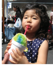
That looks yummy