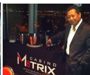
Last quarter's Third Thursday at Kubota restaurant and The M8trix