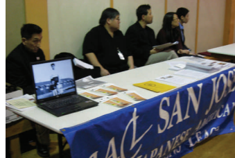
San Jose JACL Info Table