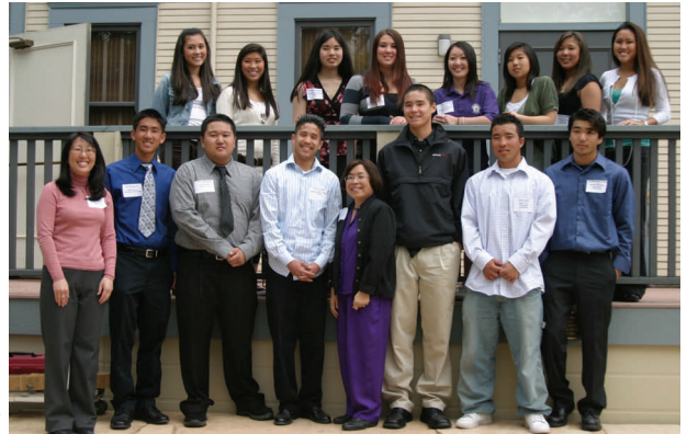
A picture of the 2007 Scholarship Recipients