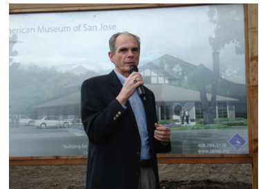
Mayor Chuck Reed