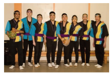
San Jose Taiko