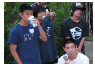
The Horis & Boons