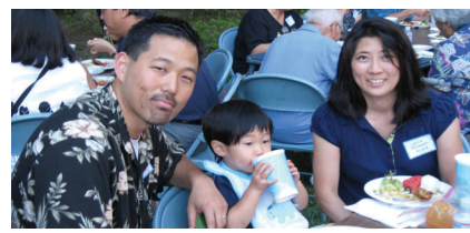
The Kimura Family enjoy the BBQ