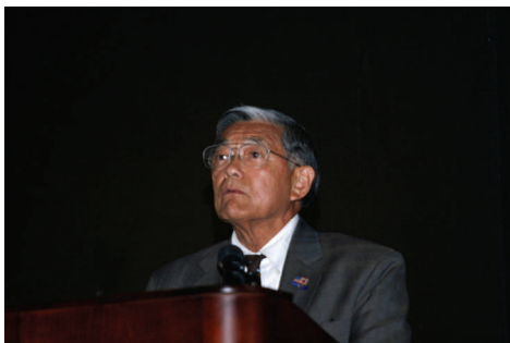
Keynote speaker, Norman Y. Mineta