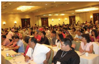
Work session at the convention