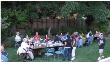
Nice crowd enjoys a summer night