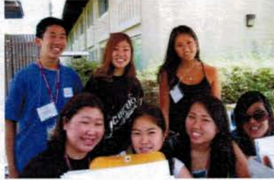
Eden Youth help with registration