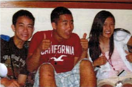
Hanging out after breakfast