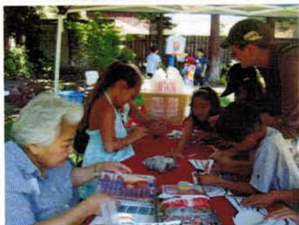
Crafts at JACL Children's Day