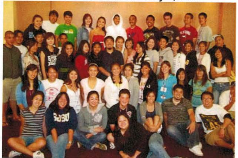
Our Northern California Western Nevada Pacific District youth participants