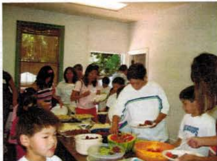
Very nice crowd at Children's Day